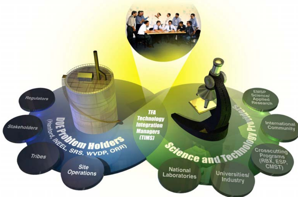
Fig. 1. TFA Integrates Science and Technology Providers and DOE Problem Holders.

To accomplish this, TFA plans and manages an S&T development program of approximately $65 million per year to address needs that the sites have identified to accomplish their clean up missions. TFA interfaces with S&T providers across the country, indeed around the world, to bring S&T to the sites to use to solve their problems. Use is the key concept in the vision, and a fundamental aspiration embedded in the program vernacular --the sites are users .