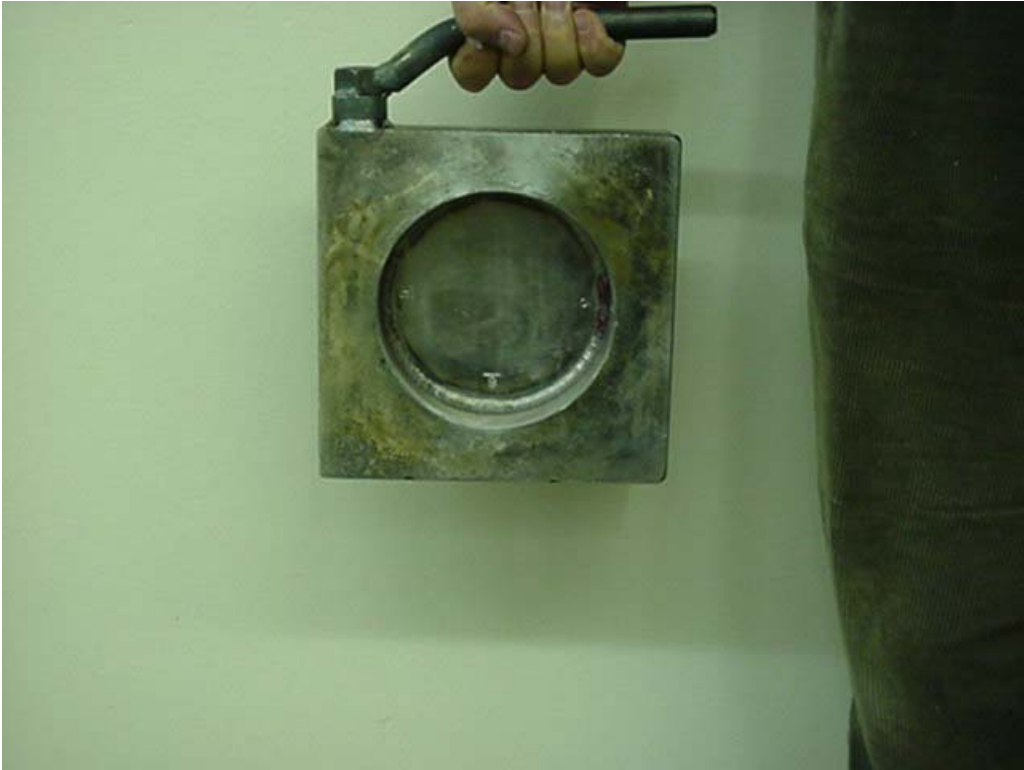
Fig. 2. Workmanship Coupon