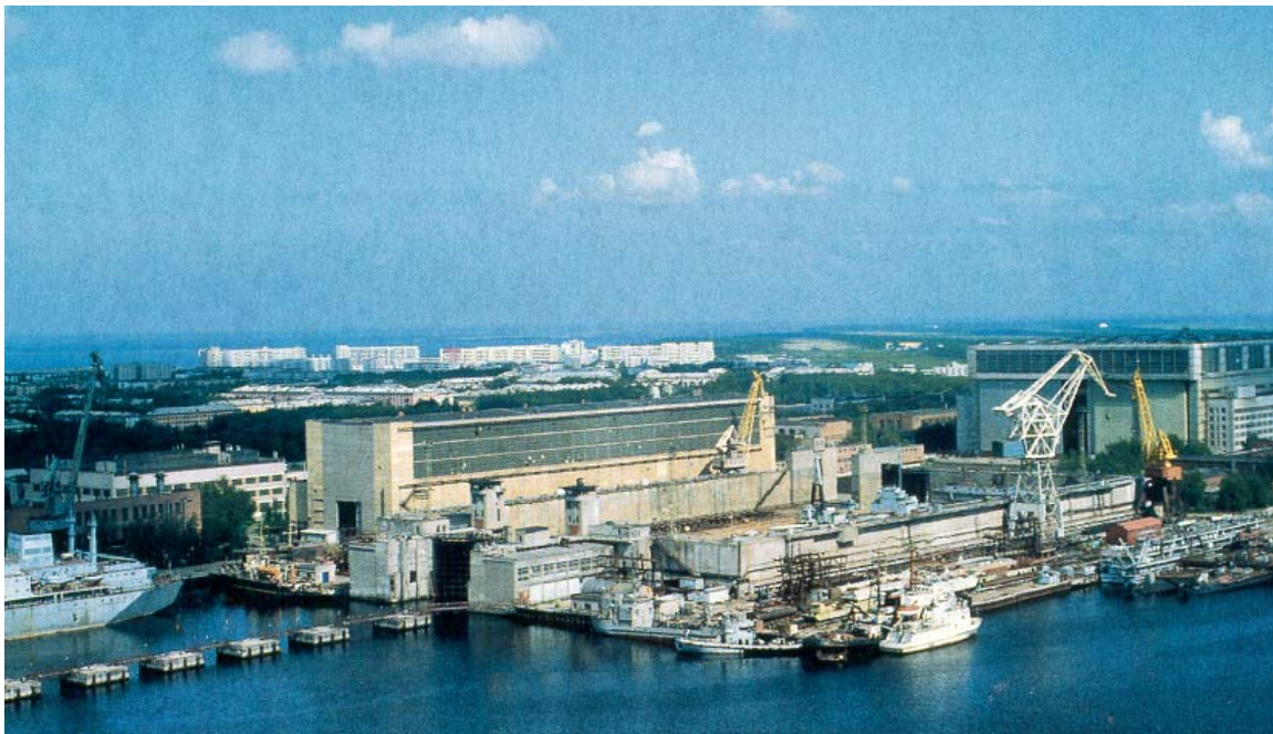
Fig. 1. View of the "Zvyozdochka" Shipyard

The Federal State Unitary Enterprise (FSUE) "Zvyozdochka" is a specialized enterprise for shipbuilding and ship repair, as well as for the recycling of materials from dismantled ships and vessels (see Fig. 1). FSUE "ME" Zvyozdochka" is an advanced, well-equipped complex with extensive technical and industrial capabilities.