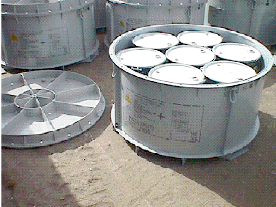
Fig. 2. PST1A-6 Container with Seven Standard 200-liter Drums

The container complies with requirements of IAEA and Russian Federation regulations [3,8]: