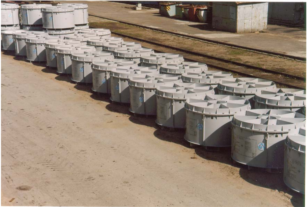
Fig. 3. The First 100 PST1A-6 Containers Before Delivery to the Russian Navy

Ideally, containers full of waste should be stored inside a building. Figure 4 presents a conceptual model for a waste storage and handling facility, with both truck and rail access. It also has a fork lift and/or bridge crane for positioning the containers inside the facility. The building itself is modular, to allow for easy expansion if more containers full of waste need to be stored. Storage facilities such as these could be built in various locations in northwest Russia.