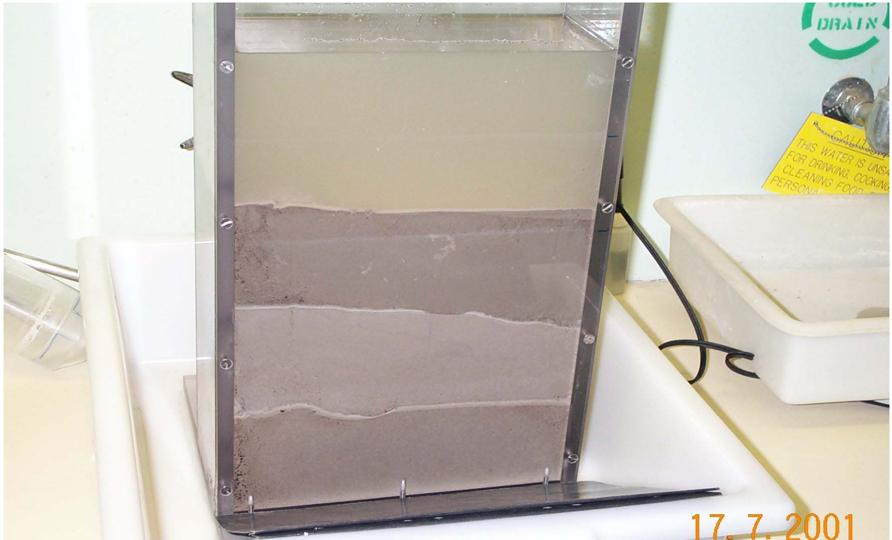
Fig. 3 Three layers of grout poured under CPP-603 simulant.