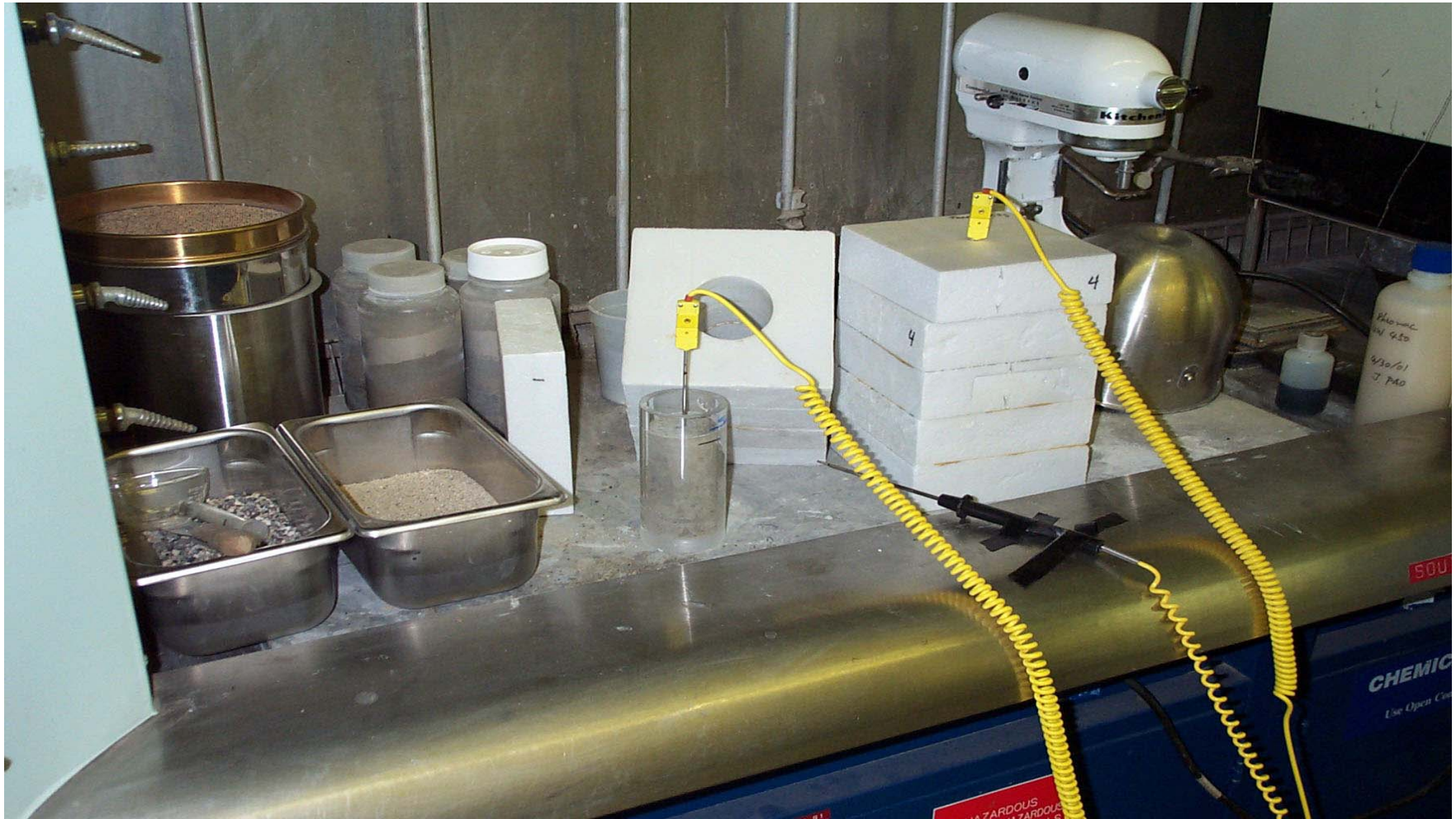
Fig. 1 Temperature Test for Grout.