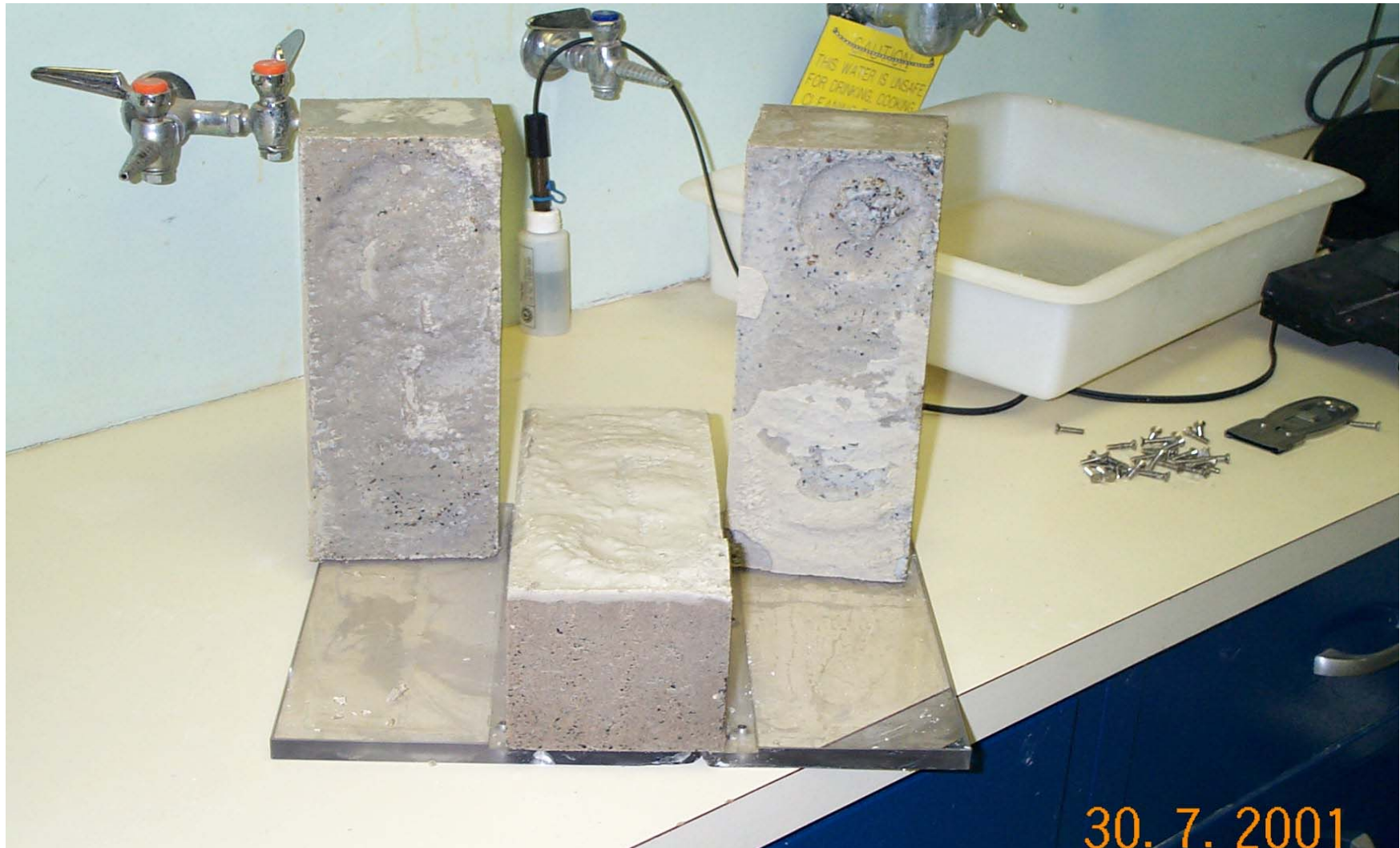
Fig. 4 Separated Grout Layers.