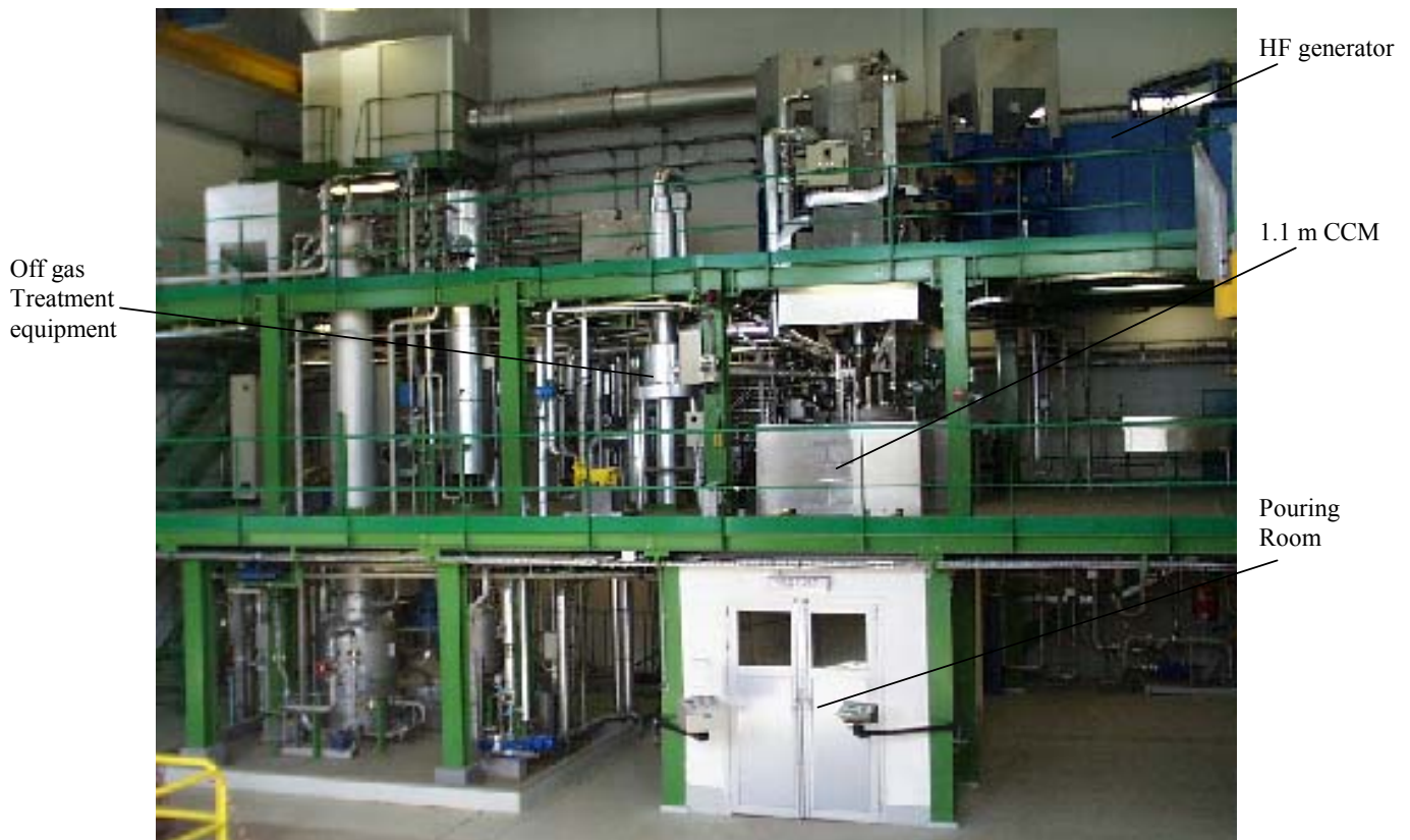
Fig. 2. General view of the platform

All the equipment – the preparation and feeding device, the vitrification system, the pouring room and the off-gas treatment system – were installed on four floors covering 160 m 2 at ground level (see general view of the platform in photo 2 below). This installation satisfies the industrial need for a compact facility that can be maintained remotely. In addition, the modular design of the plant permits the CCM to be quickly disconnected and removed.