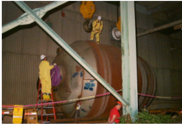
Fig. 2. Rigging K-33 Converter, One of 640 K-33 Converters, for Movement to Workshop and sizing.

Cell Floor Process Components : Cell Floor Process Components include Converters, Compressors, Electric Motors, Fifty Four inch process Pipe, and Process Valves. Converters and Compressors are sent to a disassembly/sizing workshop on the cell floor of K-33. There they are disassembled into individual components.