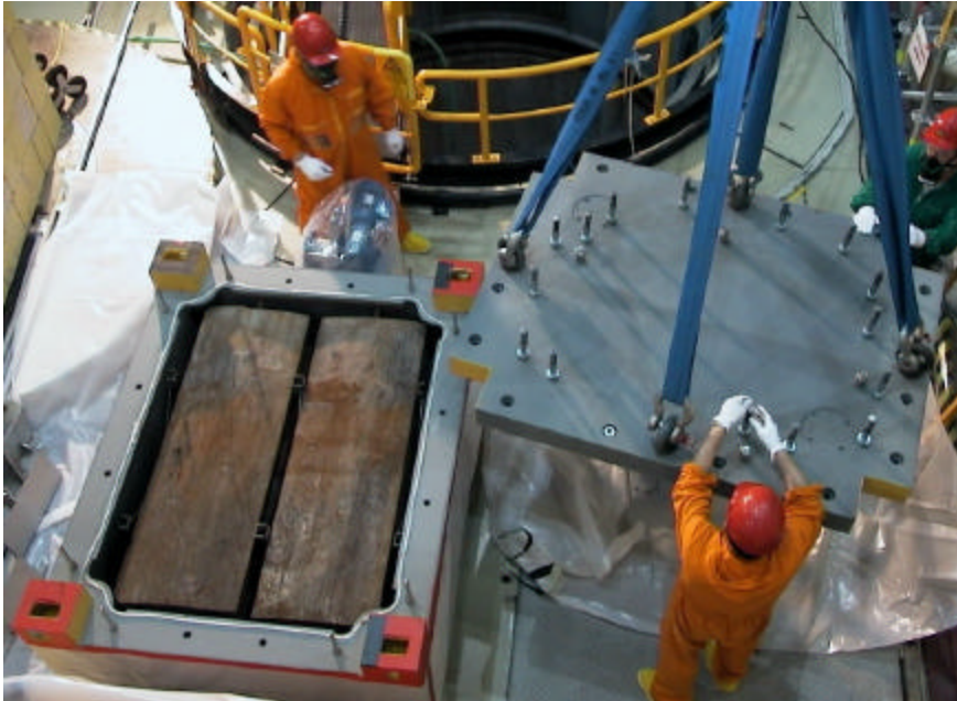
Fig. 4. MONOLITH loaded with reactor vessel Parts

The reactor vessel was a cylindrical part with a wall thickness of 104.5 mm and an inner diameter of 2438 mm. The material is carbon steel with a stainless steel plating on the inside. A segment of this vessel with a height of 1550 mm was cut in 16 parts of the same size. 8 parts with a total weight of 5050 kg were loaded into each MONOLITH container.