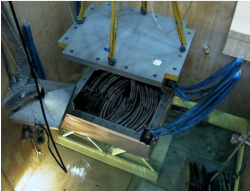
Fig. 2. Thermal Shielding loaded into one MONOLITH