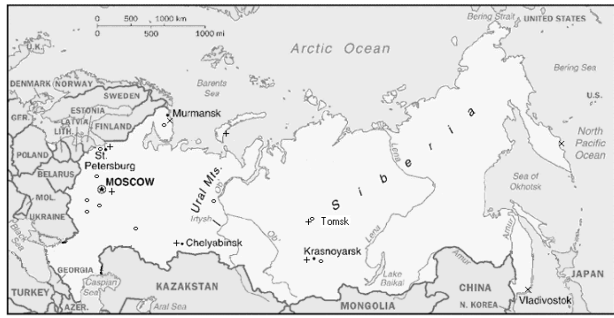
x – naval sites, o – power reactors, + -other major sites