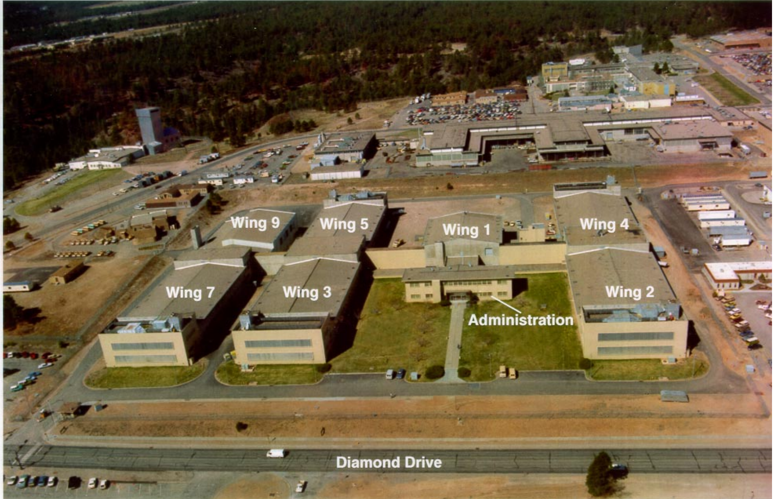
Figure 1. Chemistry and Metallurgy Research (CMR) Facility, Technical Area-3, Building SM-29