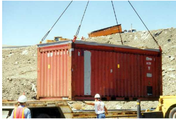
Figure 3: Conex Box Being Placed in the ERDF

boxes, reinforced their floors, and sealed them before taking them into the basin area. This low cost solution satisfied the ERDF's void space concerns and resulted in fewer doses to N-Basin workers than their original preferred alternative.