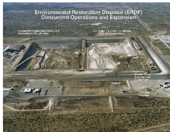
Figure 2: Aerial Photograph of the ERDF

The ERDF is a large-scale, Resource Conservation and Recovery Act of 1976 (RCRA) compliant trench with a double liner and leachate collection system. (Figure 2). The initial trench was composed of two 152 m x 152 m (500 ft x 500 ft) waste cells that were 21m (70 ft) deep. The trench is designed so that it can be expanded in two-cell increments while operations are ongoing. The first such expansion was completed in the third quarter of 1999 giving the trench a total of four cells. ERDF has two 681,000 L (180,000gal) wastewater / leachate-collection tanks. These tanks provide redundant storage for effluent resulting from the hypothetical 25-year/24-hour design storm. The leachate collection system is designed to prevent liquid from collecting in the bottom of the trench at levels greater than one foot. Most waste is transported to the ERDF on semi-trailer roll-on/roll-off trucks. A container transfer pad is located near the trench to serve as a short term container stockpile and to facilitate the transfer of containers from tractor trailer trucks that travel between remediation sites and the ERDF to a fleet of shuttle trucks. The shuttle trucks operate exclusively within the confines of the ERDF. Other ERDF features of include: A 44 L/s (700 gpm) raw water system; a 32 L/s (500 gpm) potable-water system; high- and low-voltage distribution systems, a sewer system, roadways, and the necessary utilities for pre-manufactured (trailer-type) facilities.