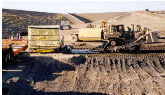
Figure 4: 105C Transfer Pit Monolith Drag Off

The lowboy with the first monolith aboard was pulled alongside the pad. After the trailer was blocked to protect it from the torsional effects of dragging the block off of it, the D-8 was tied to the block's base plate with heavy cables. Slack in the cables was taken up and the operator gradually increased the throttle until the monolith began to move. The block slid steadily and silently onto the pad with the dozer engine barely above an idle (Figure 4). The second monolith was placed in the ERDF the following week.