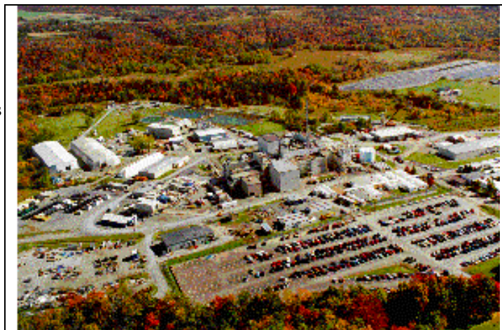
Figure 1- Aerial View of the Center

NYSERDA, a public benefit corporation established by the State Legislature in 1975, owns and manages the 3,340-acre Western New York Nuclear Service Center (Center) located about 30 miles south of Buffalo, New York (see Figure 1). The Center is home to the West Valley Demonstration Project (WVDP), a joint federal/state high-level radioactive waste cleanup project situated on about 200 acres of the Center. The U.S. Department of Energy (DOE) manages the WVDP, paying 90% of the project costs, while NYSERDA pays the remaining 10%. NYSERDA also has sole management