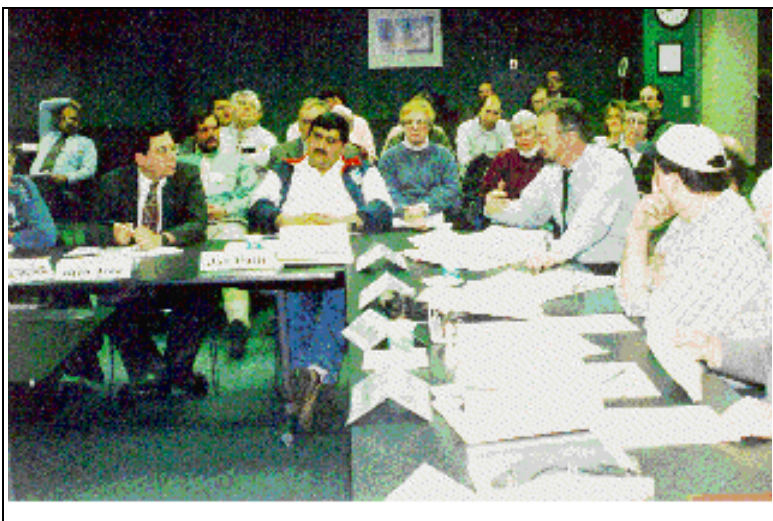
Figure 3 - NYSERDA Manager Discussing Issues with Task Force

With an increased understanding of the site, the Task Force decided to focus its discussions on those portions of the site which they believed to be the most significant and likely to drive long-term decisions. By February 1998, the Task Force started looking at the impacts of sitewide closure scenarios. To help facilitate these discussions, NYSERDA and Clean Sites, Inc. developed a table-top exercise called ConsenSite. The object of the exercise was for two players to achieve consensus (nonbinding) on a sitewide closure option. The exercise used a laminated site map and puzzle pieces to help Task Force members understand the impact of choosing the various closure options for the principal WMAs. Four members of the