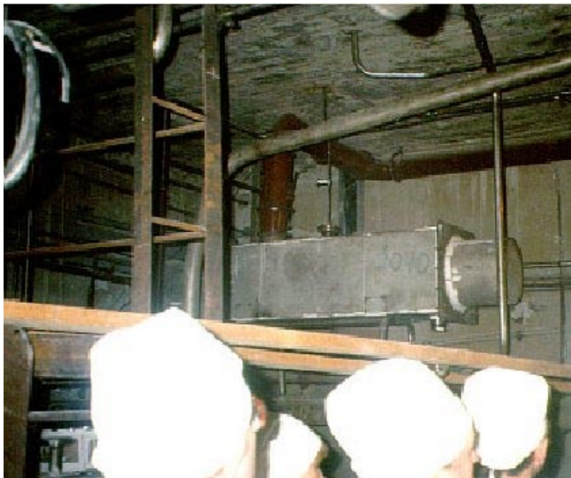
Figure 3. Photograph of installed electrochemical destructor (Unit 2)

The I&C system installation has progressed since the June inspection. Wiring and motors for motor-operated valves are in place. Cable runs to switching and control points are nearly done. However, installation of the computer-controlled PLC system, a major component of the I&C system, only recently started. The PLC system was paid for separately under the US TIES program, and delays in the delivery of the PLC system occurred initially because there were problems with getting the equipment through Russian customs without paying import fees. In addition, slight changes in process design, identified after the equipment had been ordered, required the purchase of additional equipment. These items were identified specifically at the June inspection meeting and ordered immediately. Delivery of the additional equipment is scheduled for January 1999, after a (delayed) U.S. export license was obtained. Additional delays to initiating installation (which was included under the original contract) are the result of assigning responsibilities and finalizing the logistics of installation by a U.S. company through a Russian subsidiary located in Moscow at the facility in Murmansk. Training of Murmansk personnel (also included in the contract) on the use and maintenance of the PLC systems must also be organized and completed.