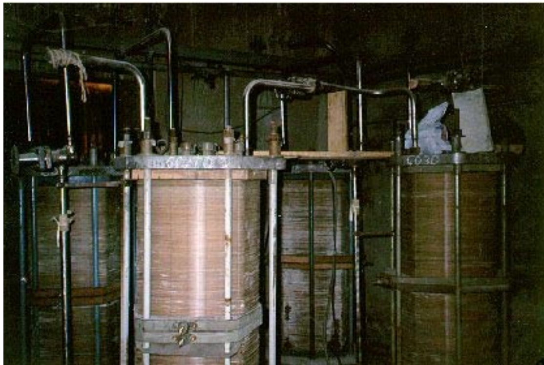
Figure 2. Photograph of installed electro-dialyzer unit for salt removal (Unit 6)

reagents, especially complexants, such as Trilon B (containing EDTA and oxalate) are also present in Solution #2. EDTA and oxalate present an additional challenge because, if their concentrations exceed 1 mg/L and 2 mg/L, respectively, they will degrade some of the specialized sorbents and the salt removal systems. Salt removal by electro-dialyzer and electro-membrane concentrators (Unit 6) are required because discharges into the Kola Bay have regulatory maximum concentration limits for salinity (about that of freshwater, even though the Bay is salt water). (Figure 2 is a photograph of the installed electro-dialyzer units.)